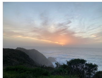
Sunset on the Sonoma Coast